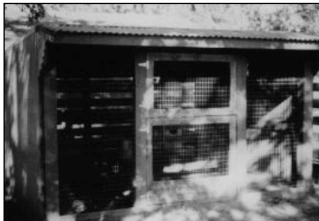
A typical building used for growing broilers for a youth project.

sides during brooding and in cold weather. Make certain the concrete or dirt floor is at least 6 inches above ground level to prevent flooding. The roof overhang should be sufficient to effectively protect against blowing rain.