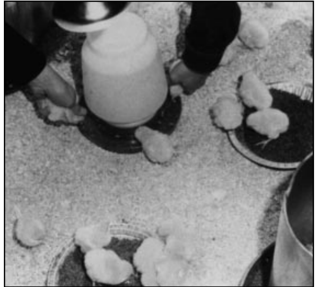
Water, feed and a heat source are all essential in getting broiler chicks off to a good start.

After the broilers are four weeks old and fully feathered, heat is seldom required. Some exhibitors tend to keep their birds much too warm. This will affect feathering, flock uniformity, fleshing and finish.