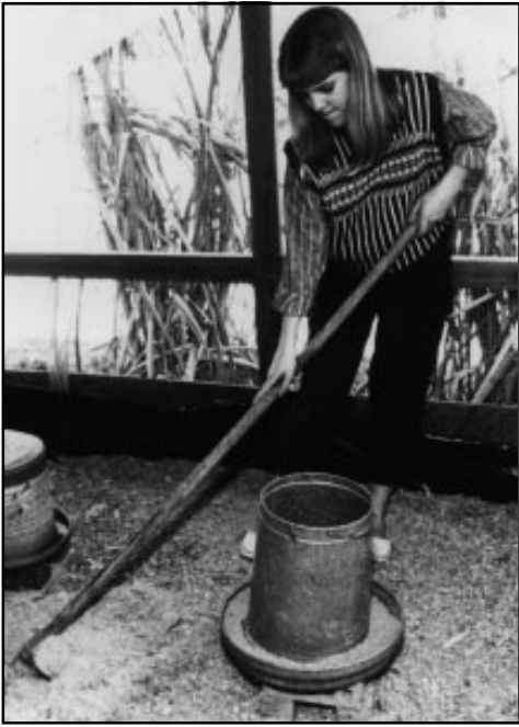
Stir the litter daily to prevent packing. Damp or caked litter will cause health problems and affect broiler performance.

Small amounts of broiler feed moistened with milk and cooking oil and fed several times during the day will stimulate older birds to eat more and increase growth. This supplemental feeding practice can be particularly helpful in hot weather with broilers over four weeks of age. Caution: Do not put out more moistened feed than the broilers can eat in 10 to 15 minutes. Do not moisten the feed until feeding time. Be certain all birds can eat at the same time. Feed any leftover moist feed to the culled birds.