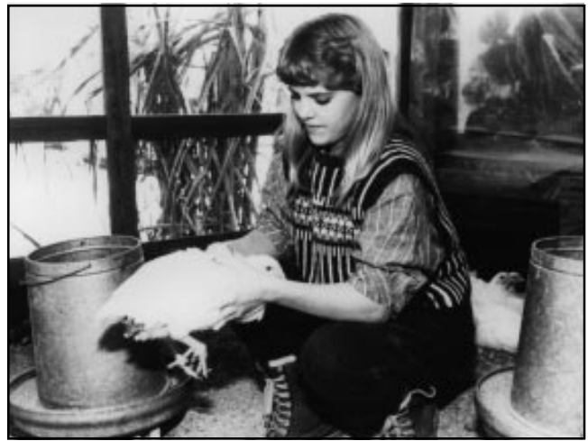
Handle broilers carefully. Keep feeders and waterers level with the back height of the broilers.

Broilers respond to attention. Walk among broilers and stir feed three to five times per day. This will provide exercise and increase feed consumption and growth.